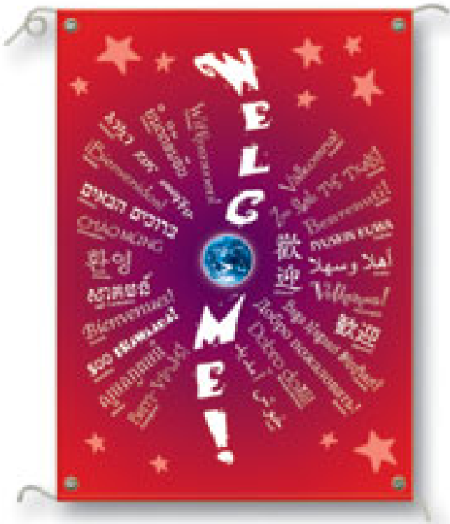
Welcome banner in 25 different languages www.alastore.ala.org