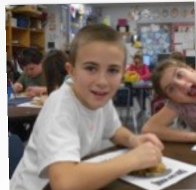
DIGGING FOR GOLD