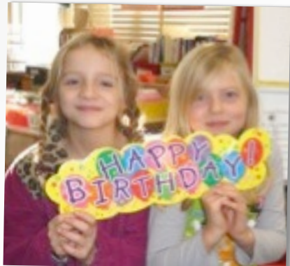
DECEMBER BIRTHDAY GIRLS