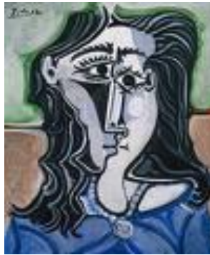
Pablo Picasso

F ifth grade students, as mentioned are hard at work making foil repousse relief sculptures of a Vermont bird for the museum exhibit this October. Other projects coming up this semester will be a self portrait lesson done in the cubist style of Picasso. They will learn about the artist’s life and works. The students will also be incorporating color theory knowledge as they complete the self portraits as part of the fifth grade art assessment for the